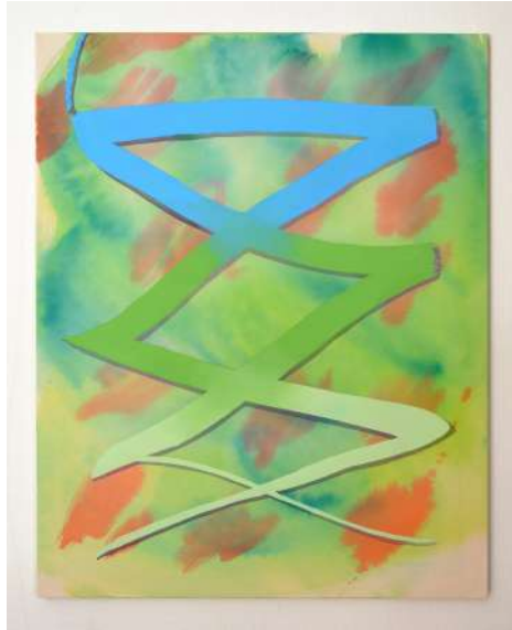
Hazel Ann Watling D'PAK & OPRAH 6 2020 aquarelle, encre et acrylique sur toile (coton) sur châssis, vernissé à la bombe (UV protection mat) 10 x 80cm