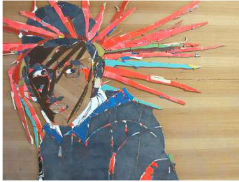
Karim Ghelloussi Le gars de Tébessa ( Mémoire de la jungle ) 2019 Chute de bois 146 x 175 x 4 cm