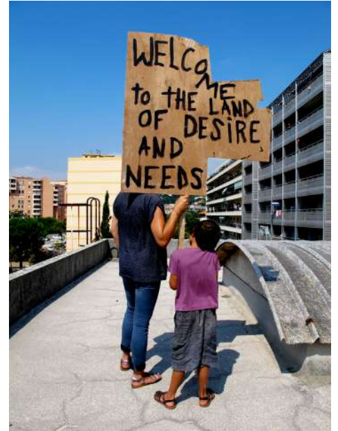
Karim Ghelloussi Welcome to the land of desire and needs 2015 Photographie encadrée 21 x 30 cm