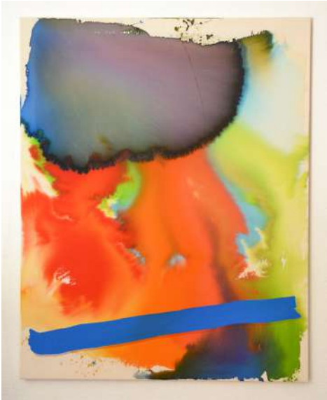
Hazel Ann Watling D'PAK & OPRAH 3 2020 aquarelle, encre et acrylique sur toile (coton) sur châssis, vernissé à la bombe (UV protection mat) 10 x 80cm