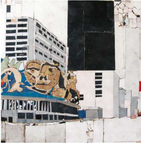
Karim Ghelloussi Ici comme ailleurs ( Au Val D'argent ) 2019 Chute de bois 140 x 140 x 4 cm