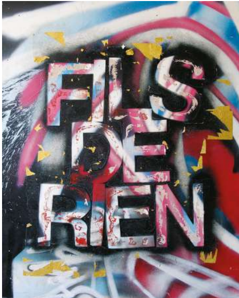
Karim Ghelloussi Fils De Rien 2018 95 x 77,5cm